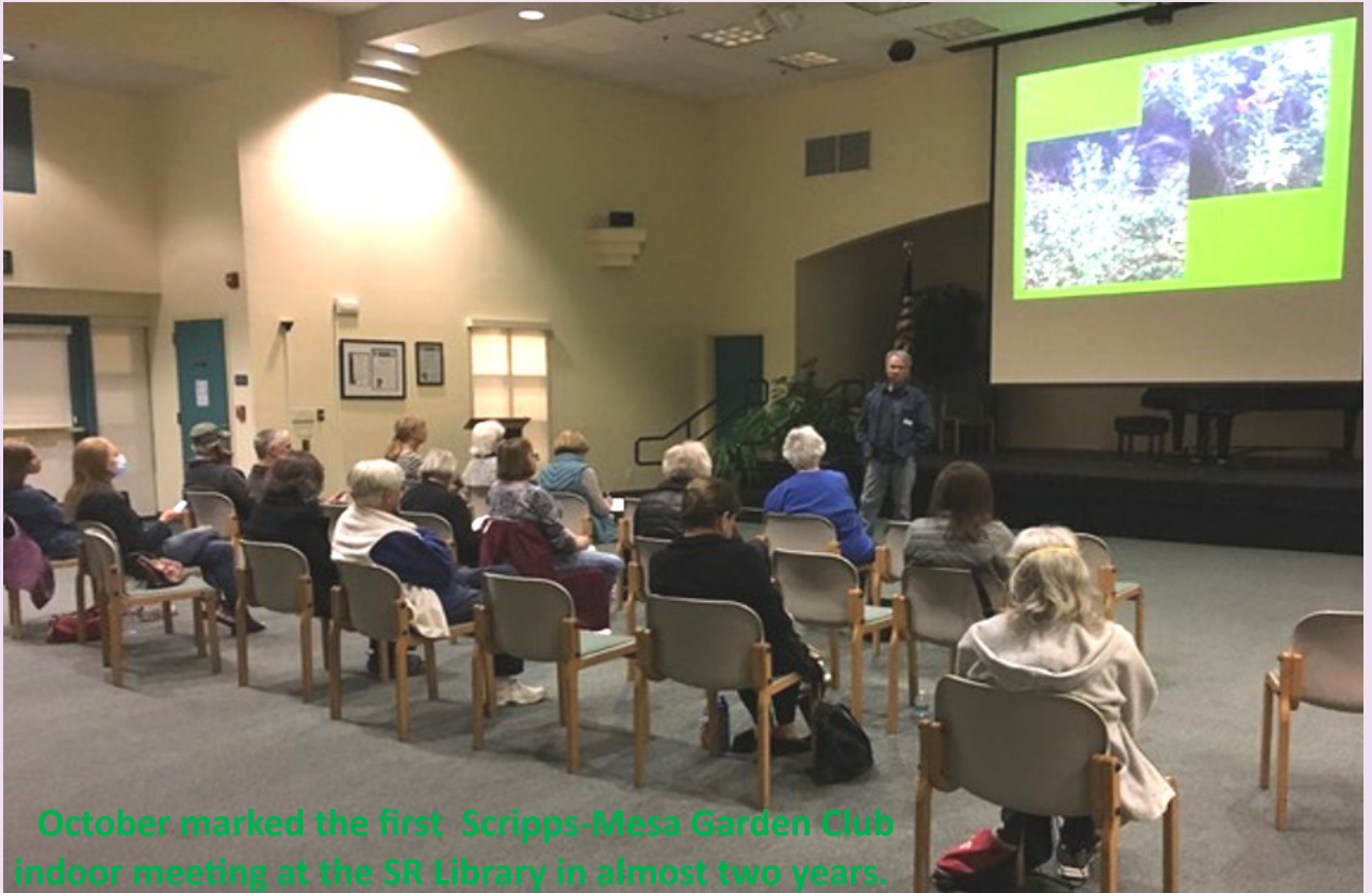
October marked the first Scripps-Mesa Garden Club indoor meeting at the SR Library in almost two years.