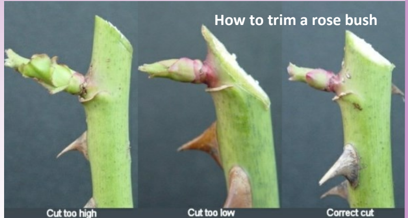
How to trim a rose bush