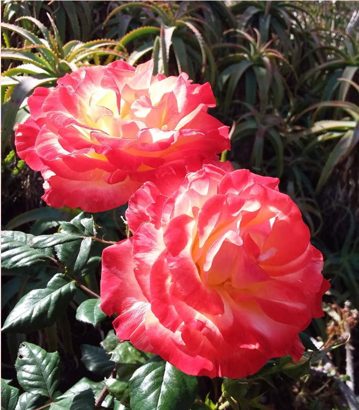
Char Fitzgerald's roses