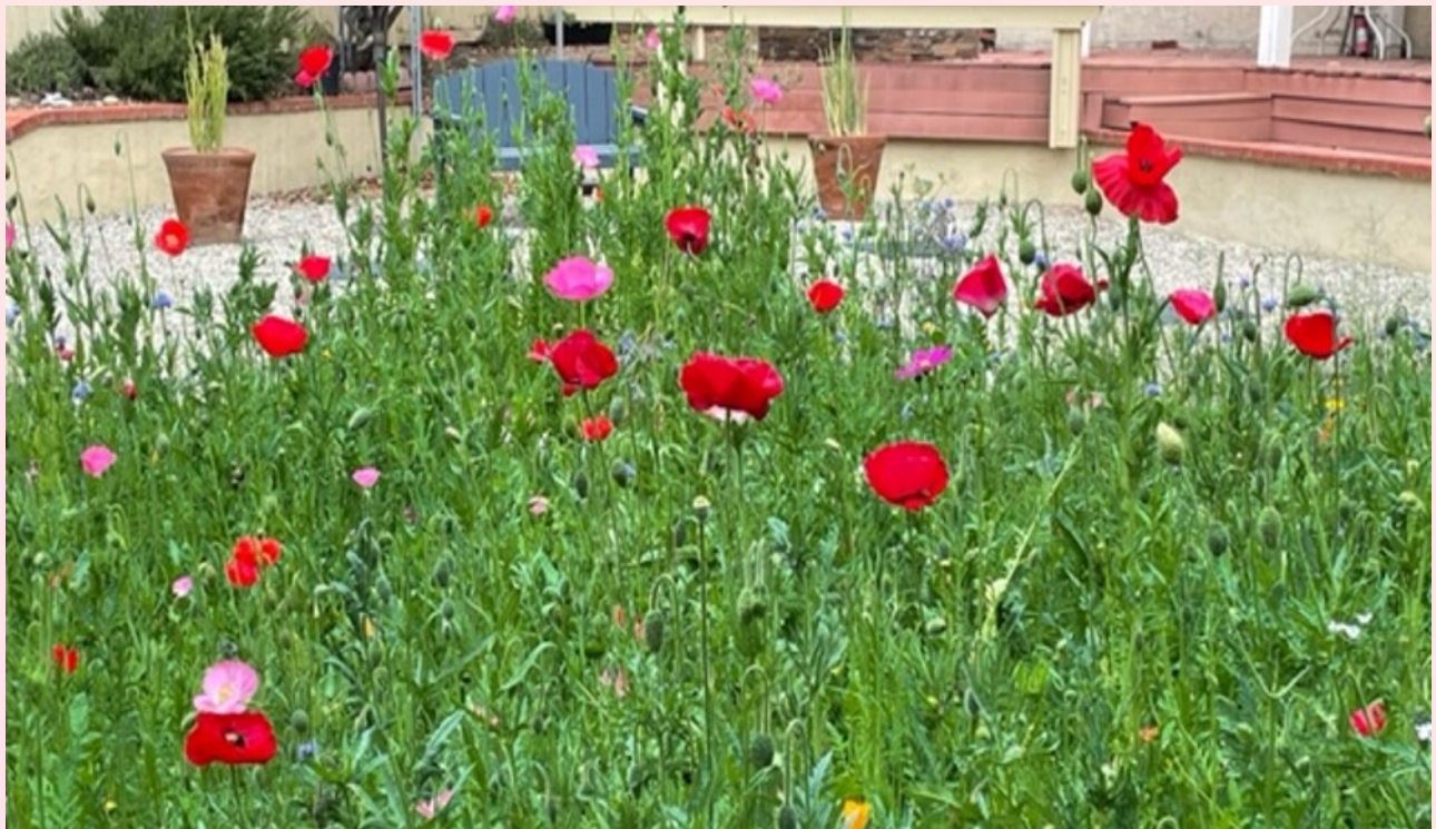
Brydon Bennett's meadow