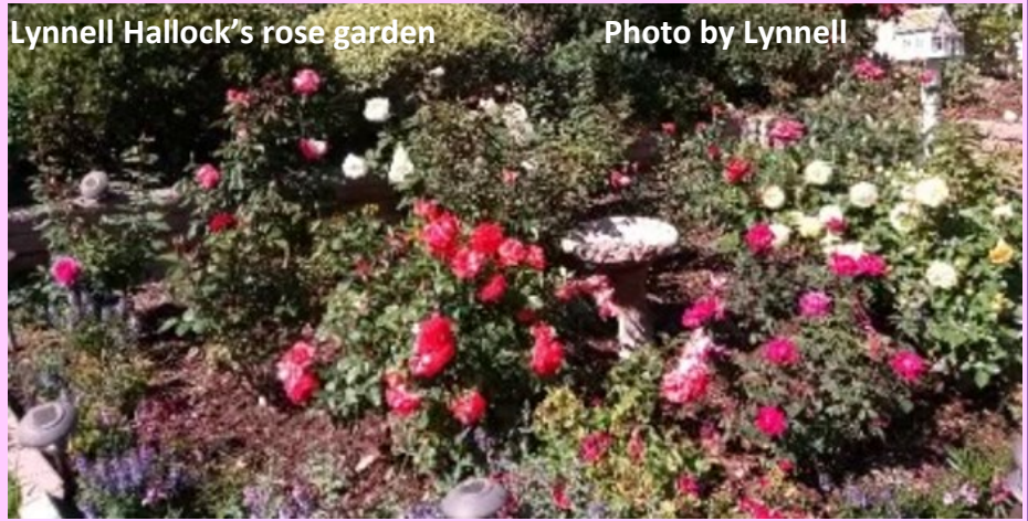
Lynnell Hallock's rose garden