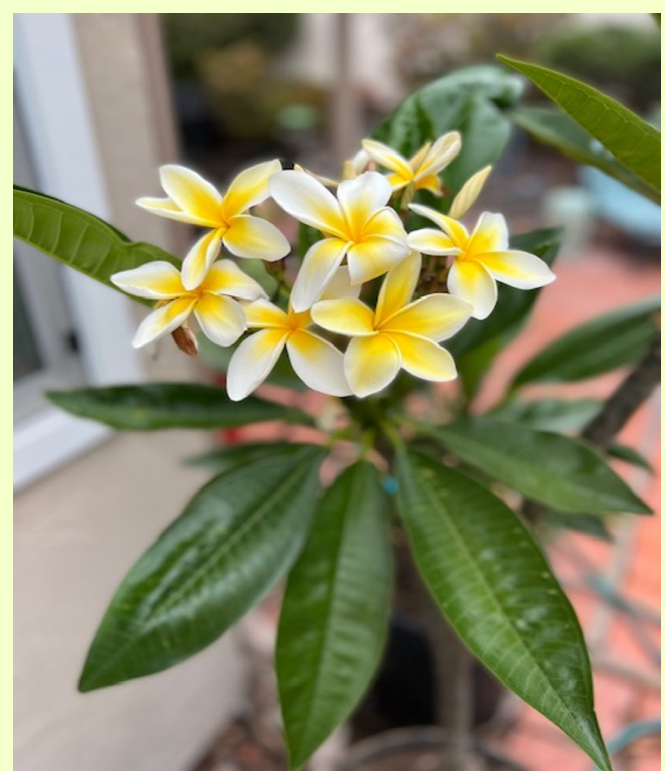
Plumeria and their wonderful scent beautify Susan Castellana's garden.