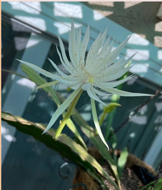
Blooms in Susan Castellana's Garden